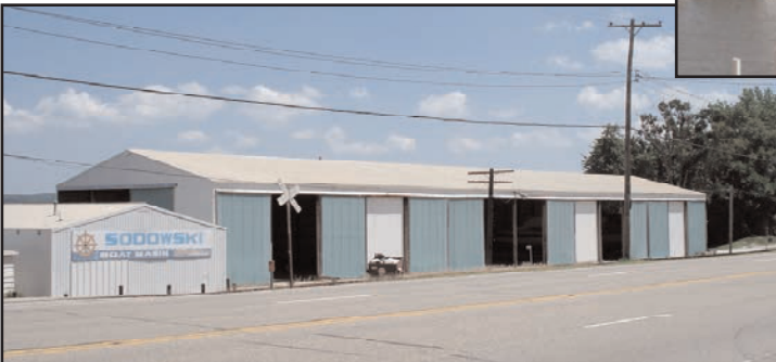
Clubhouse & boat storage