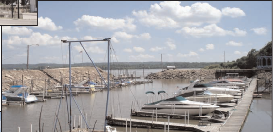
+/- 50 marina slips