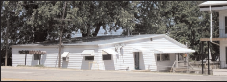
Residence with 4 bedrooms, walk-in closets, 2 baths, +/- 2,300 sf