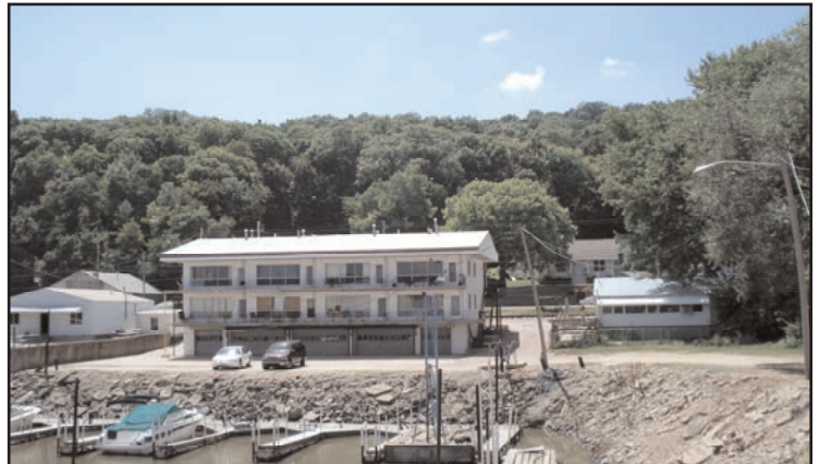
Eight one bedroom apartments 800 sf each with indoor parking spaces